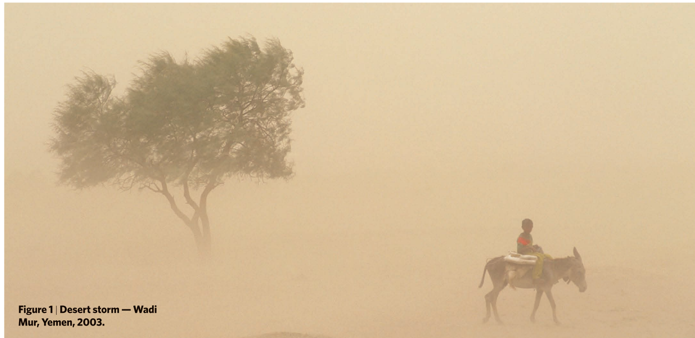
Figure 1 | Desert storm — Wadi Mur, Yemen, 2003.